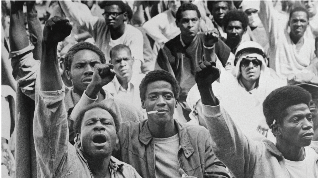
1971 Attica Prison Strike

The prisoners on strike are demanding an immediate end to the inhuman violence perpetrated against them and improvements in basic necessities. They also demand minimum wage laws apply to prisons, ending the common practice of paying prisoners pathetic sums of money for forced labor – in Louisiana it is as low as four cents per hour. The prisoners are demanding that racist over-sentencing and parole denials for minorities be stopped, and that all prisoners have a right to eventual parole, not having to die in prison. Finally prisoners are demanding rehabilitation and education programs that have been cut.