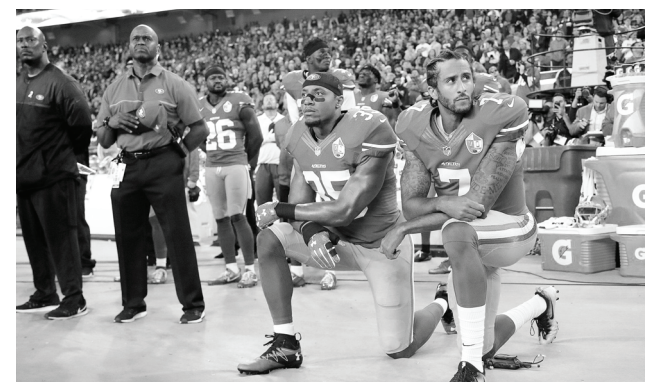
Colin Kaepernick and Eric Reid take a knee in 2016

themselves in the flag, opposing Kaepernick and other athletes. But many have supported the protests, which have spread to other athletes in the NFL and other professional sports, along with college, high school and youth sports. Even many bands at sporting events and national anthem singers themselves have joined the protest.