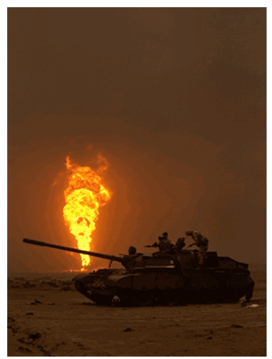
25/3/91 Al Maqwa, Kuwait

In 1991, the U.S. launched Operation Desert Storm, a massive invasion against Iraq. During the six-week long invasion, 1000 bombing runs were made per day, 250,000 people were massacred, and Iraq's infrastructure was left in ruins. Ammunition rounds used in combat contained depleted uranium, a heavy and dense metal made from spent nuclear fuel. Low levels of radiation in the metal can become extremely toxic after weapons are fired, and the radioactive material gets dispersed into the air and dust. Depleted uranium has been linked to increased cancer rates in both the Iraqi population and in Gulf-War veterans.