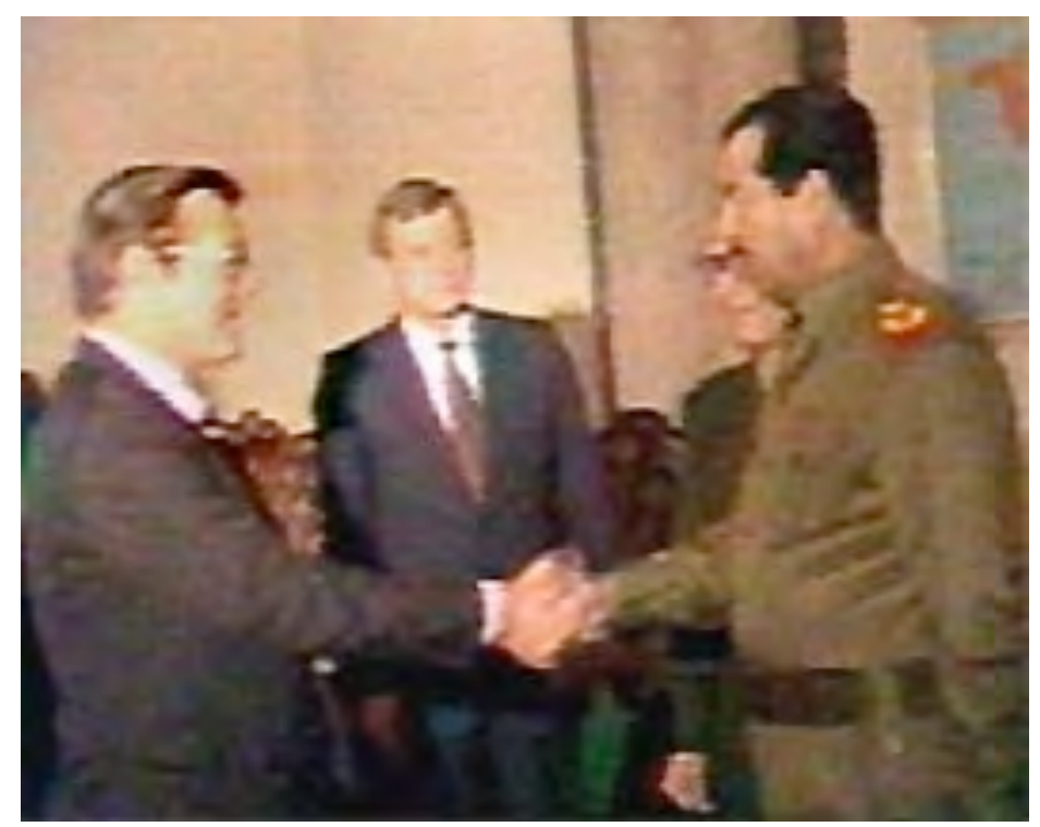
Donald Rumsfeld, Envoy to Iraq 1983

During the Iran-Iraq war, the U.S. provided Iraq with economic aid, weapons, and the materials for biological and chemical weapons. These included $5 billion in agricultural credits, as well as $684 million to build an oil pipeline through Jordan (Construction to be undertaken by Bechtel Corporation). Saddam launched an attack on the Kurdish town of Halabja where Kurds had begun a revolt. The gas attacks killed 6,800 people. Ironically Saddam would later be tried and convicted for this U.S. supported massacre. Overall during the war, more than a million people lost their lives, 400,000 from Iraq alone.