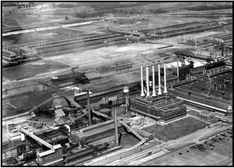
Aerial shot of Ford River Rouge Plant, which was more than 1.5 miles long and included over 93 buildings

On the other hand, starting in 1919, he set up the Ford Service, the largest private police force in the world -- around 3000 gangsters, ex-convicts, prizefighters, wrestlers, and others. They didn't wear uniforms or ID.s, and some worked in the plants. They engaged in