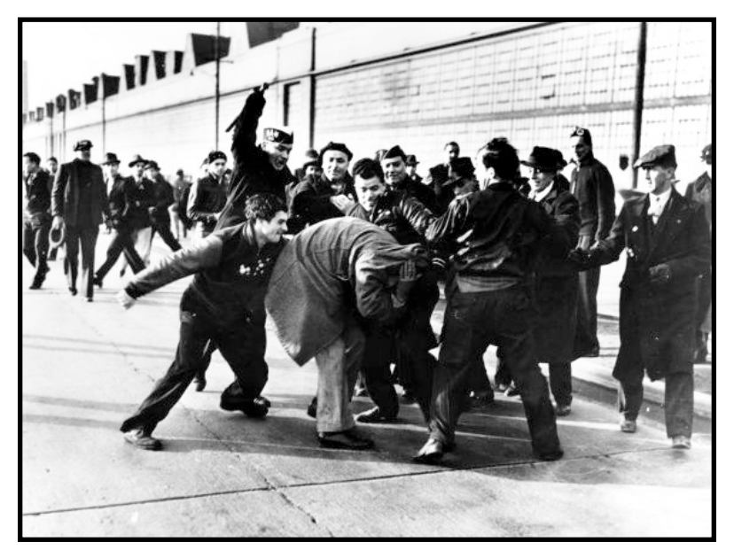
Striking workers confront a strikebreaker during the strike

In March 1932, unemployed Ford workers marched on the plant and were fired on by Ford security. Four workers were killed. In 1937, union organizers who went to Gate 4 to distribute union literature were beaten up.