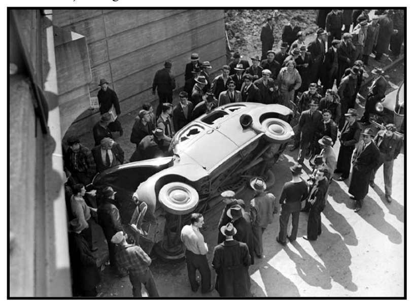
Aftermath of a battle with Ford during the strike

The local Ford union set up a committee charged with dealing with issues of race. They put out educational literature and took a clear stand opposing racism. In Ford Facts, they showed Black workers that the UAW had Black committeemen stewards, and members of the negotiating committee. They had integrated baseball teams (long before the major leagues!)