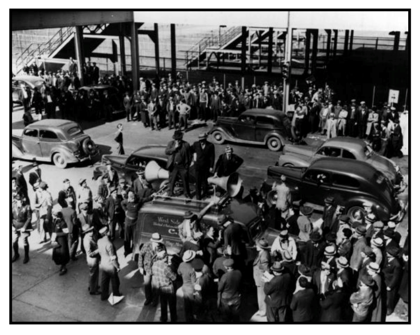
Workers rally during the strike

On June 20, the contract was signed. For the first time, it provided for dues check-off, seniority, and a grievance procedure. It raised wages